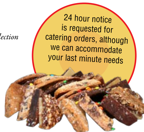
Combo Sweet Tray

24 hour notice is requested for catering orders, although we can accommodate your last minute needs