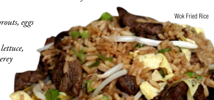
Wok Fried Rice

Seasoned chicken & beef, lettuce, pico de gallo, salsa, Monterey Jack, Cheddar cheese, corn tortillas, rice, refried beans